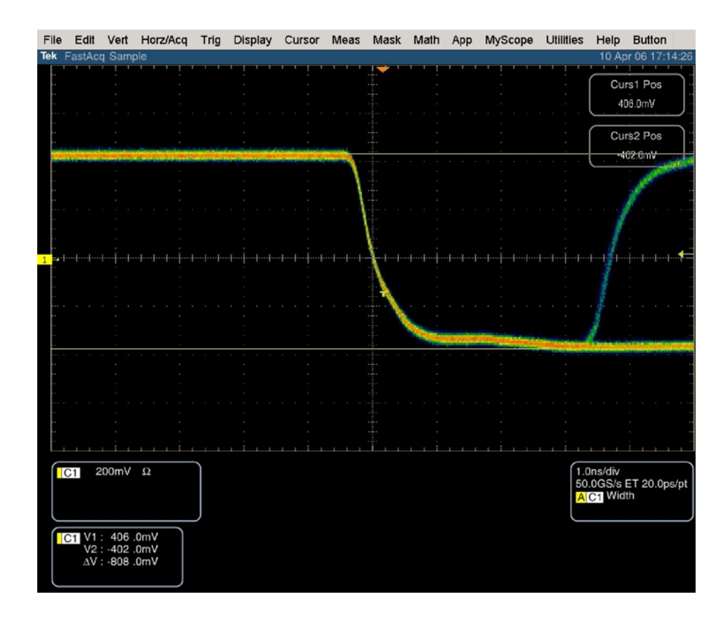
Figure 2-3: Trigger polarity positive