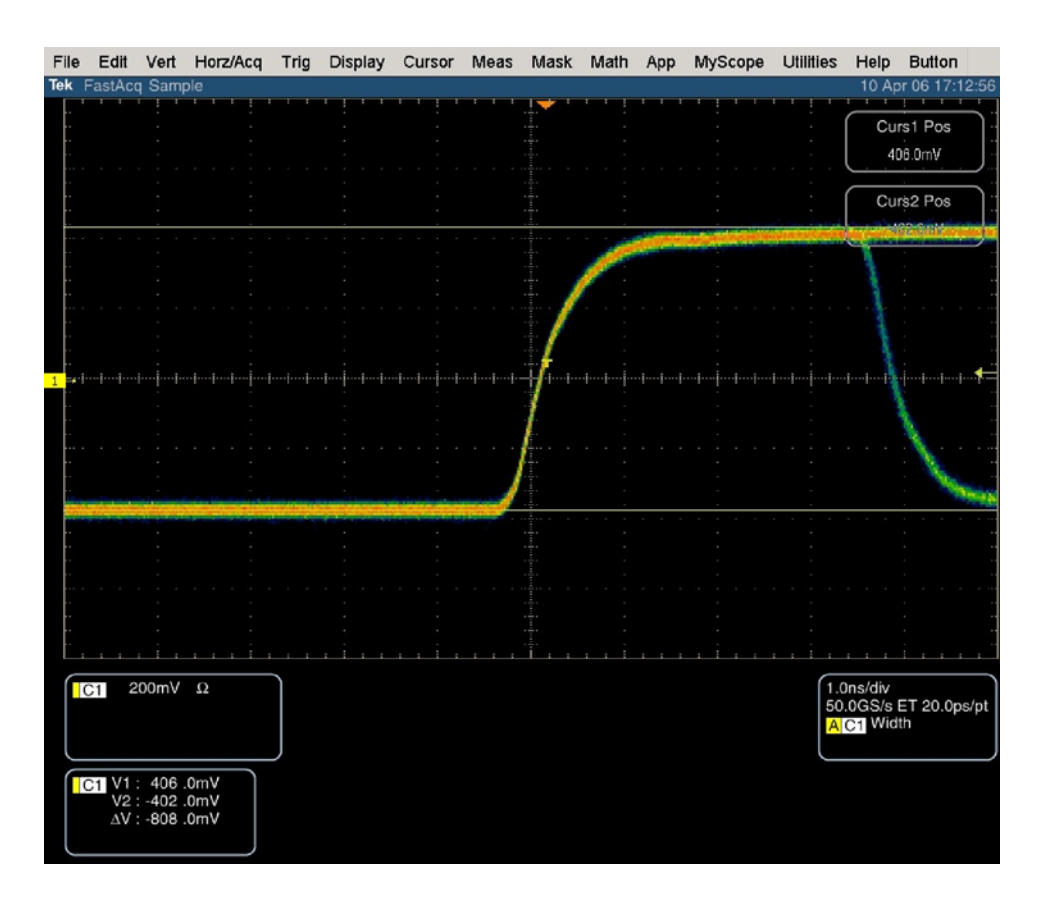
Figure 2-4: Trigger polarity negative